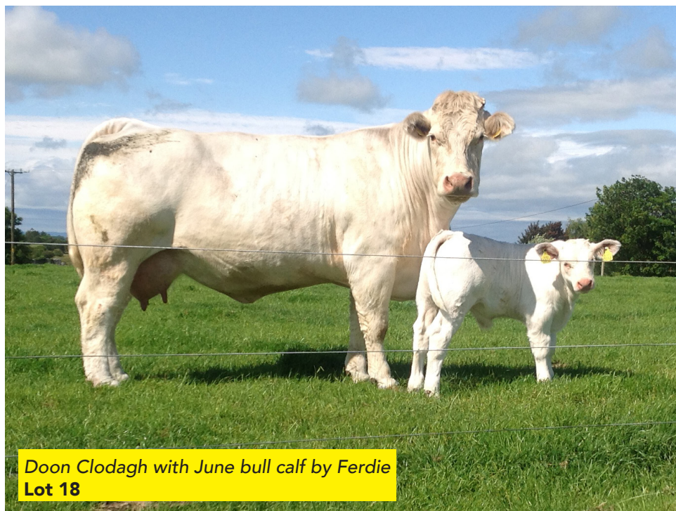
Doon Clodagh with June bull calf by Ferdie Lot 18