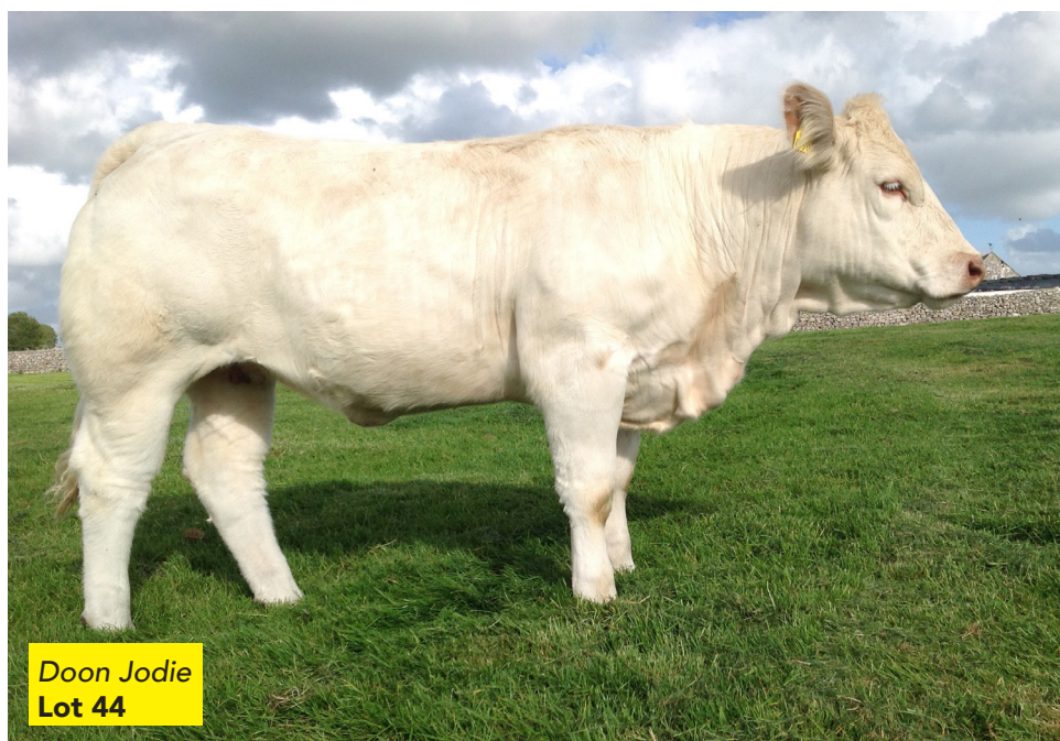
Doon Jodie Lot 44